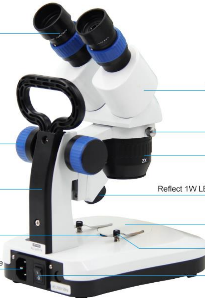
A22.1237-TA Track Stand+Touch Switch Binocular Stereo Microscope