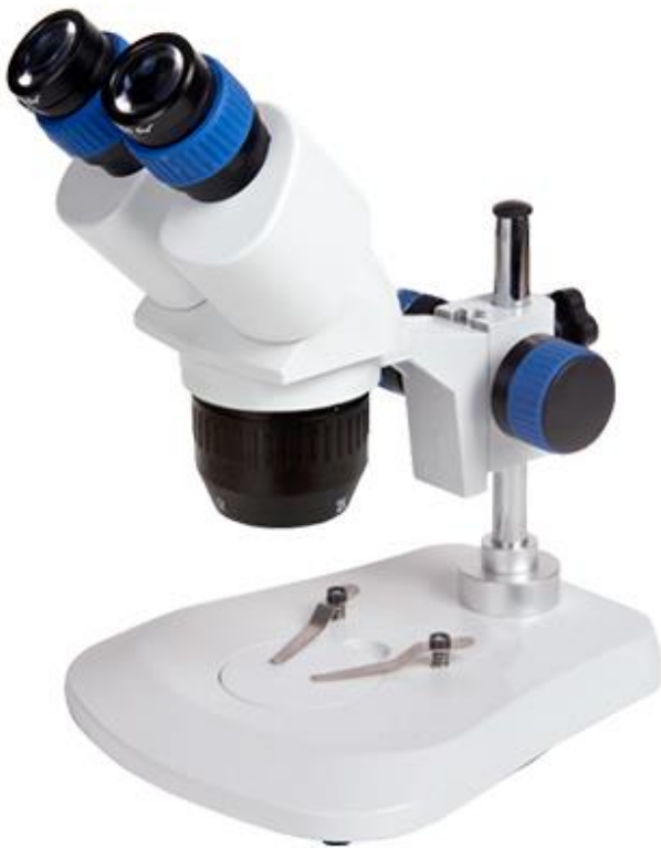
A22.1237-P Pole Stand