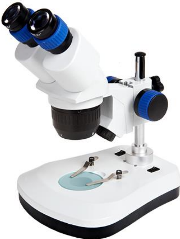
A22.1237-PB Pole Stand+Dial Switch